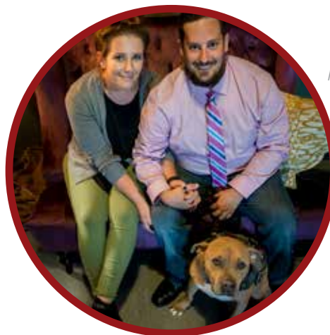
Mason Lane Photography